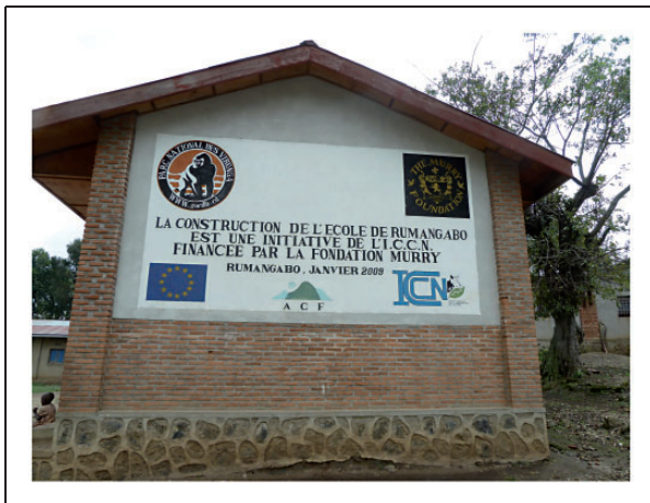
Figure 6. Community Development Programme around Virunga NP, developed by the delegated management partner.

national who is not affiliated with the governmental structure overseeing PAs nor by the private party. The management unit, directed by the board, is without exception headed by a professional employed by and representing the private partner, the director of the PA. The director leads a team of heads of management units, such as administration, infrastructures, community relations, ecological management, and law enforcement. Several PAs, such as Nouabale-Ndoki, Akagera, and Zakouma have a law enforcement officer headed by the park director, who also remains within the hierarchical system of the responsible governmental structure and thereby has the right of drawing up certified reports and