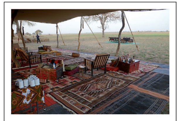
Figure 8. Camp nomade a tented camp that is moved approximately every month, extending the touristic offer of Zakouma NP.

wearing arms. This allows the necessarily functioning of law enforcement in a delegated management setup.