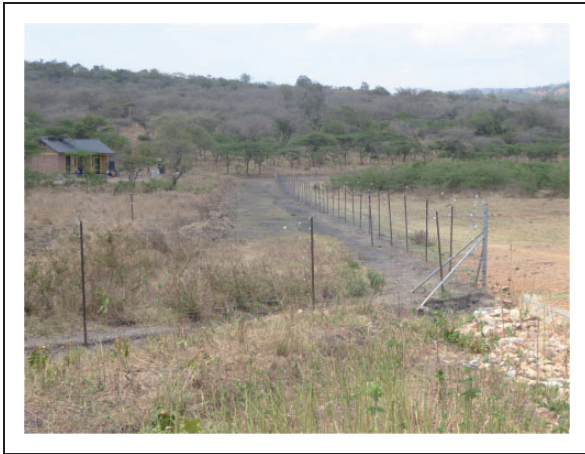
Figure 5. Akagera National Park (Rwanda) Electric Fence, a 2.8 mio $ investment through Rwandan public funds at the start of the delegated management period. Its maintenance, with considerable annual costs, has been assured by the private delegated management partner. This has allowed the re-introduction of Lion and Black Rhino part of an intensified tourism program (photo by Paul Scholte, 2016).