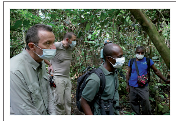
Figure 3. Nouabalé-Ndoki National Park (Congo) Gorilla tourism program initiated by the private delegated management partner based on an earlier research program.