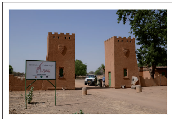
Figure 4. Entrance of Zakouma National Park (photo by Paul Scholte, 2017).