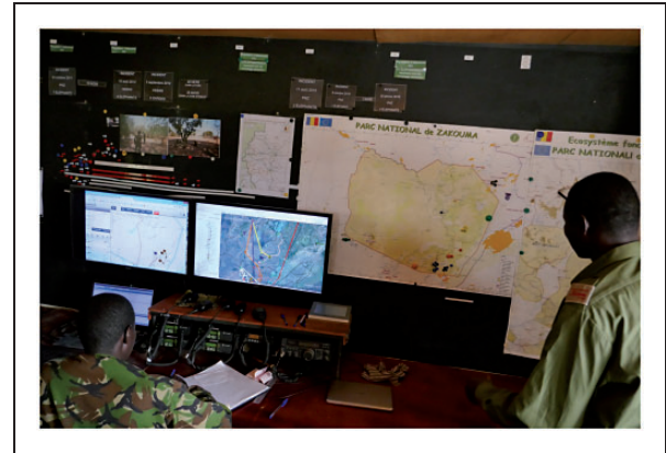
Figure 7. Control room Zakouma National Park, heart of the protection system, developed during the delegated management period.

national who is not affiliated with the governmental structure overseeing PAs nor by the private party. The management unit, directed by the board, is without exception headed by a professional employed by and representing the private partner, the director of the PA. The director leads a team of heads of management units, such as administration, infrastructures, community relations, ecological management, and law enforcement. Several PAs, such as Nouabale-Ndoki, Akagera, and Zakouma have a law enforcement officer headed by the park director, who also remains within the hierarchical system of the responsible governmental structure and thereby has the right of drawing up certified reports and