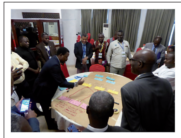
Figure 1. Seventh meeting of the Protected Areas & Wildlife Working Group of COMIFAC (Libreville, December 2017).